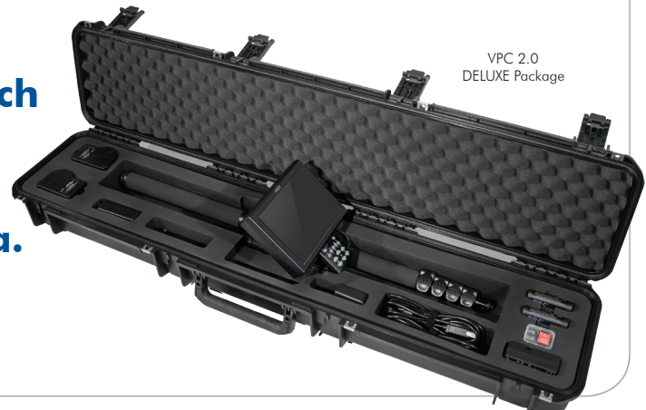
VPC 2.0 DELUXE Package

Inspect hard to reach areas with the portable VPC 2.0 Video Pole Camera.