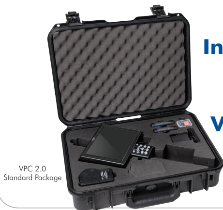
VPC 2.0 Standard Package

Inspect hard to reach areas with the portable VPC 2.0 Video Pole Camera.